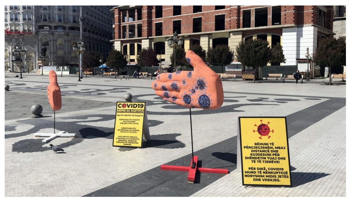
Skopje's city centre looks abandoned amid coronavirus fears.