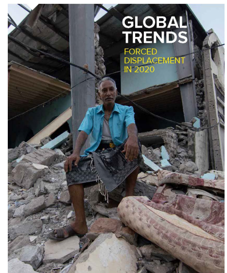
UNHCR's 2020 Global Trends report

United Nations Development Programme (UNDP) has rebuilt the only kindergarten in Shuto Orizari Municipality with support of the Kingdom of Norway, after it burned down in 2017. Within the rebuilt kindergarten is the Center for daily support for at-risk children that will provide care and educational activities for approximately one hundred at-risk children between the ages of 5 and 13. Since North Macedonia established a remote learning process during the pandemic, these at-risk children have once again been left to their own devices, resulting in them abandoning their learning practices due to school lockdowns and a lack of suitable IT equipment to facilitate educational activities in the future. UNDP is now organizing a crowdfunding initiative to give at-risk children from Shuto Orizari a chance to continue their learning process, gain new skills and stay off the streets.