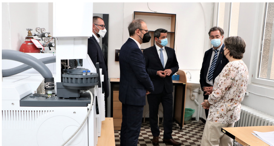
UNOPS procured new equipment for environmental analysis for the Laboratory for Chromatographic Analysis

The United Nations Office for Project Services (UNOPS) has procured and delivered new equipment for conducting environmental analysis to the Laboratory for Chromatographic Analysis of the Institute of Chemistry. The equipment worth $94,000 has been donated by the Kingdom of Norway through the Nordic Support for Progress of North Macedonia project and will be used for independent monitoring and control of the environmental effects of the OHIS lindane deposits clean-up process. The Laboratory has received different types of equipment such as gas chromatograph, samplers, concentrators, labware, solvents and standards that will ensure regular monitoring of pollutant emissions in the air and the soil in line with the OHIS clean-up monitoring plan. In parallel, UNOPS will also support the laboratory in the accreditation process to ensure that the methods used by the laboratory are in accordance with the highest standards.