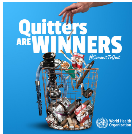
Campaign materials from the WHO No Tobacco Day activities for 2021

an event in partnership with the Public Health Institute, during which data on tobacco use in North Macedonia and the world was presented and WHO's quitting toolkit was promoted. Other flagship days observances through social media included World Bicycle Day (3 June), World Environment Day (5 June), World Food Safety Day (7 June) and World Blood Donor Day (14 June).