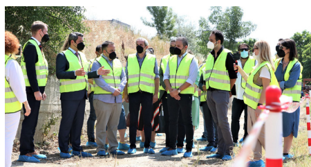
Clean-up activities in the former factory OHIS were launched

The field works for the remediation of the lindane deposits from the small dumpsite in the former factory OHIS have officially started. The complex clean-up operation is a coordinated activity of the Government of North Macedonia, the Ministry of Environment and Physical Planning, UN Office for Project Services (UNOPS) and the UN Industrial Development Organization (UNIDO) who joined forces to coordinate operations on the ground that will be carried out in line with national and international standards. In this partnership, UNOPS manages the Multi Partner Environmental Fund set up to mobilise national and international resources to sustain the cleaning of this site and facilitate donors' coordination. The clean-up activities are expected to be completed by July 2022.