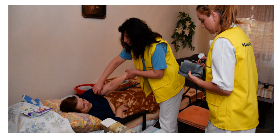
New Community Works Programme was launched in 56 municipalities engaging 500 unemployed people as social service providers

UNDP launched the new annual cycle of the Community Works programme with the selection of 56 municipalities