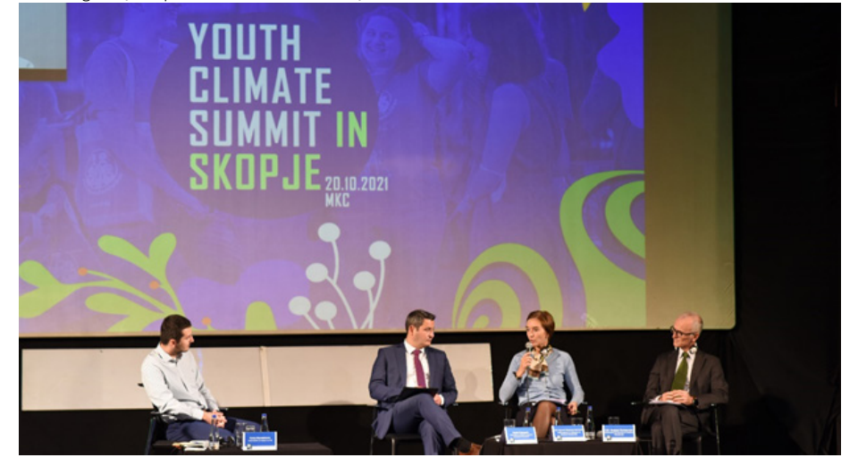
Youth Climate Summit in Skopje supported by UNICEF together with the Italian, Swedish and British Embassies in North Macedonia.

To strengthen the capacities of the State Council of prevention of juvenile delinquency a report for capacity development initiatives has been produced. In the following period workshops and trainings will be organized to incorporate innovative practices and approaches in conducting research and reaching out to beneficiaries and stakeholders at national and local level. In order to ensure child participation, UNICEF is supporting the engagement of 60 adolescents who will become advocates for justice for children and will design and develop ideas for equitable access to justice. The open call for youth advocates has been published and preparations for the