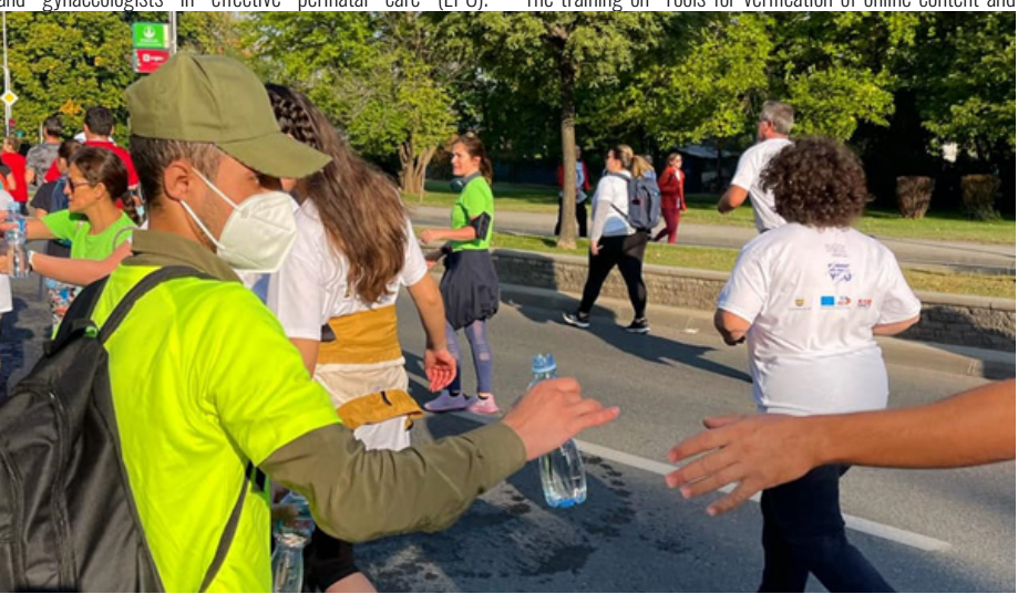
Young refugee volunteering at the UNHCR water station on Skopje Marathon 2021

The training on "Tools for verification of online content and