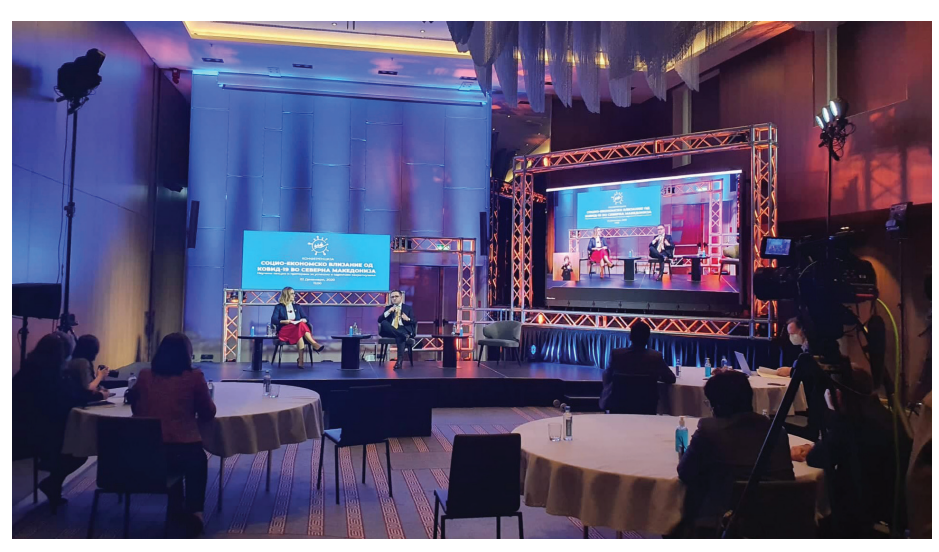
A photo from the opening of the 22 December hybrid conference on the socio-economic impact of COVID-19 in the country, organized jointly by UN in North Macedonia and Finance Think

that integrates green and innovative sources to post-pandemic growth, while building system resilience and ensuring inclusiveness, with special focus on women. To overcome the disproportionally stronger crisis impact on women and to transform gender disparities into an accelerator of growth, the Government needs to commit to and enhance skills for gender-responsive budgeting, invest in care economy and enhance efforts to raise public awareness that challenges the deeply rooted prejudice against women.