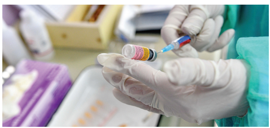
Vaccine preparation.