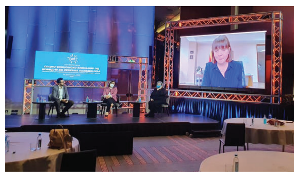
Mila Carovska, Minister of Education and Science, speaking at the 22 December conference on the socio-economic impact of COVID-19 in North Macedonia

a low pay. The organization aspects, e.g. who can transit to telework and who will take care of children, are also important to address. The Labour Law currently under development should streamline aspects exposed by the pandemic to build resilience for potential future shocks.