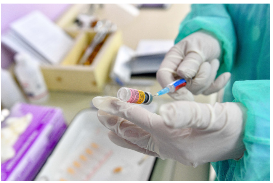
Vaccine preparation.

A key development in the pandemic response is the availability of safe and effective vaccines. The potential impact of vaccines to help us end this pandemic will take time and can only be realized if