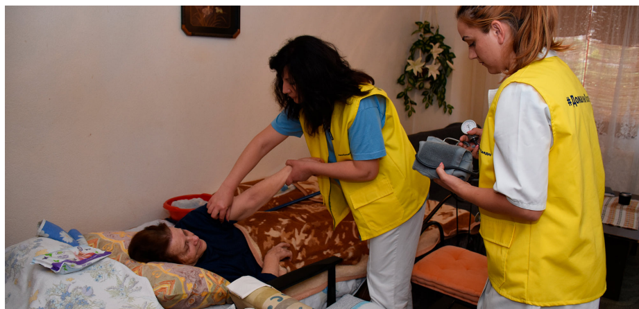
New Community Works Programme was launched in 56 municipalities engaging 500 unemployed people as social service providers

Within the regional UN Women programme "Implementing Norms, Changing Minds", funded by the European Union, the Macedonian Helsinki Committee for Human Rights organized a closing on the topic "How to strengthen the role of civil society in implementing the Istanbul Convention"? (13 September). At the event held on 13 September, participants discussed the first draft shadow report to GREVIO produced by nine CSOs members of the Gender Equality Platform.