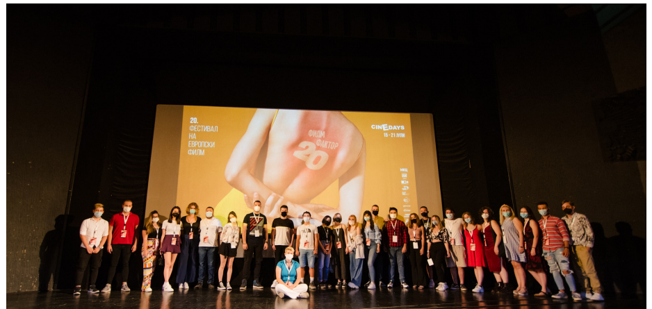
ECO programme on CINEDAYS film festival was organised to promote activities on the importance of protecting our environment

UNICEF, supports development of a National Strategy on Justice for Children in the Republic of North Macedonia [2022-2026] and Action Plan [2022-2023]. The Strategy is being developed in close collaboration with the State Council for Prevention of Child Delinquency, with support from international expert, through series of workshops and consultation, and will be adopted by end of 2021. Activities are part of the EU funded and UNICEF co-funded project "Justice for Children – EU for juvenile and child-friendly justice". The